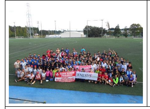
September 14th [Lecture on the theme] Lecture on international exchange through Rugby